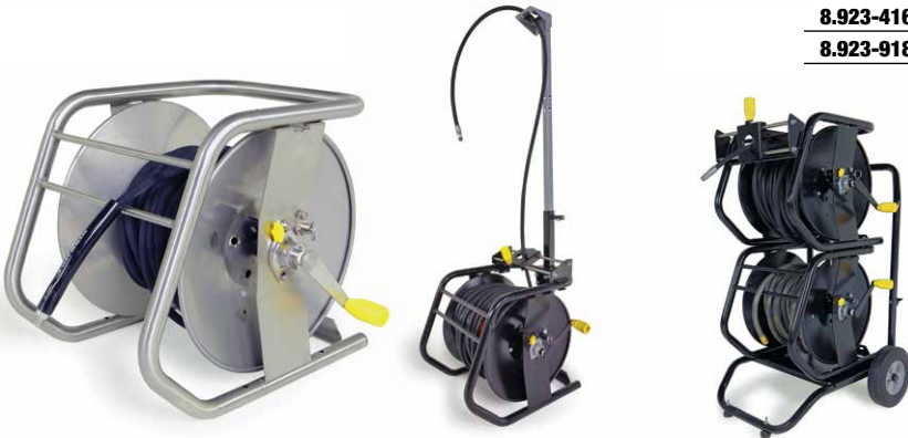
Stainless Steel Stackable Hose Reel