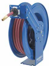
8.723-649.0 (hose and ball stop not included)