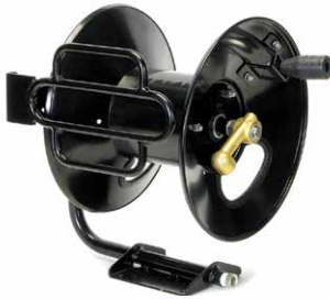
Fixed Base Hose Reel

Offering 100' and 200' reels in both a fixed base and 360 degree rotating base. The oversized reel holds the advertised length plus leaves additional space reducing the difficulty of reeling hose. The unique extended swivel improves the hose connection and reduces hose wear and stress.