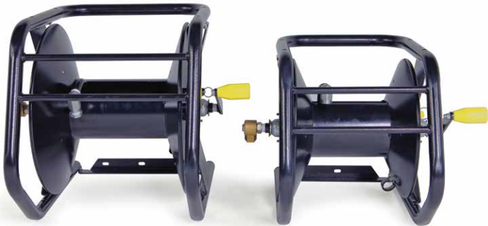
200' Mild Steel Stackable Hose Reel