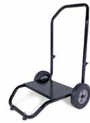
Reel Cart System