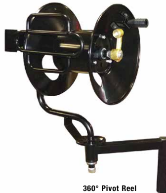
360° Pivot Reel